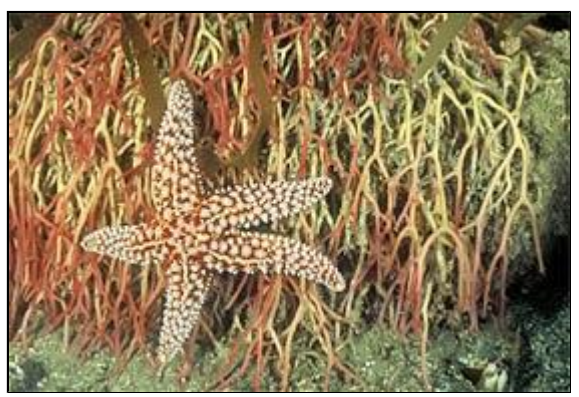
Biologists found that pisasters flourished at the test reef, as did crabs, starfish, tunicate, surf perch, blacksmith, kelp bass, sand bass, lobsters and sheephead.

San Onofre opened its first reactor in 1968, a second one in 1983 and a third in 1984. The first reactor was retired in 1992 and is being dismantled. The second and third reactors are in use.