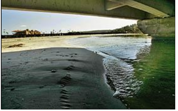
Sand will be removed from this small inlet to the San Dieguito Lagoon to allow tidal waters to revitalize the wetland. Berms will ensure that sediments and silt reach the mouth of the San Dieguito River, where the north-south current will deposit it as new sand on Del Mar's beaches.

By the time construction ends in 2009, workers will have moved 2 million cubic yards of earth; created more than